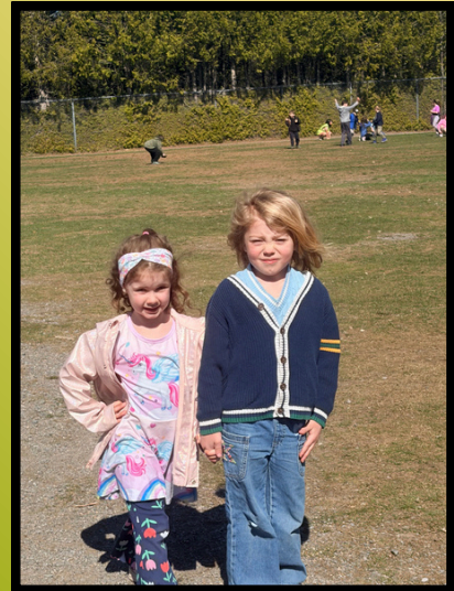
Testing out a homemade windsock