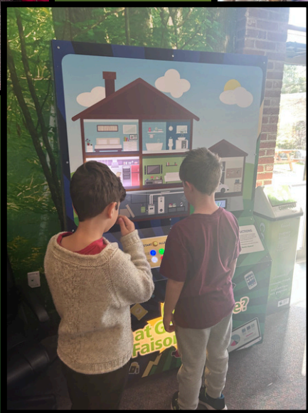
Gr. 4 Crane Mountain Visit